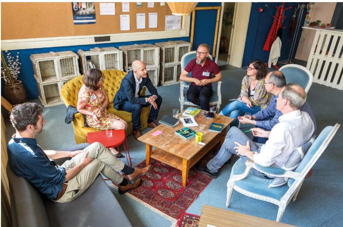
Group discussion during the second City Lab in Brussels

However, there are many examples of cities taking innovative steps around climate adaptation. These include the UIA initiatives in Paris (FR) and Barcelona (ES) to transform schoolyards into 'cool islands' and Seville (ES), a city that is redesigning neighbourhoods using co-creation approaches with citizens 8 .