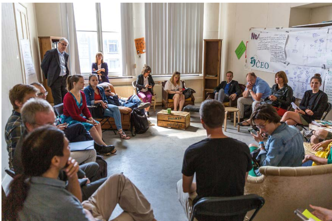
A session during second City Lab, Brussels

The second City Lab took place in Brussels in July 2019 and focused on the principle of sustainability. This City Lab paper summarises the findings from the event. A third City Lab will look at balanced territorial development in January 2020 in Porto and a final City Lab will take place in Berlin next year to combine our key messages in the spring of 2020.