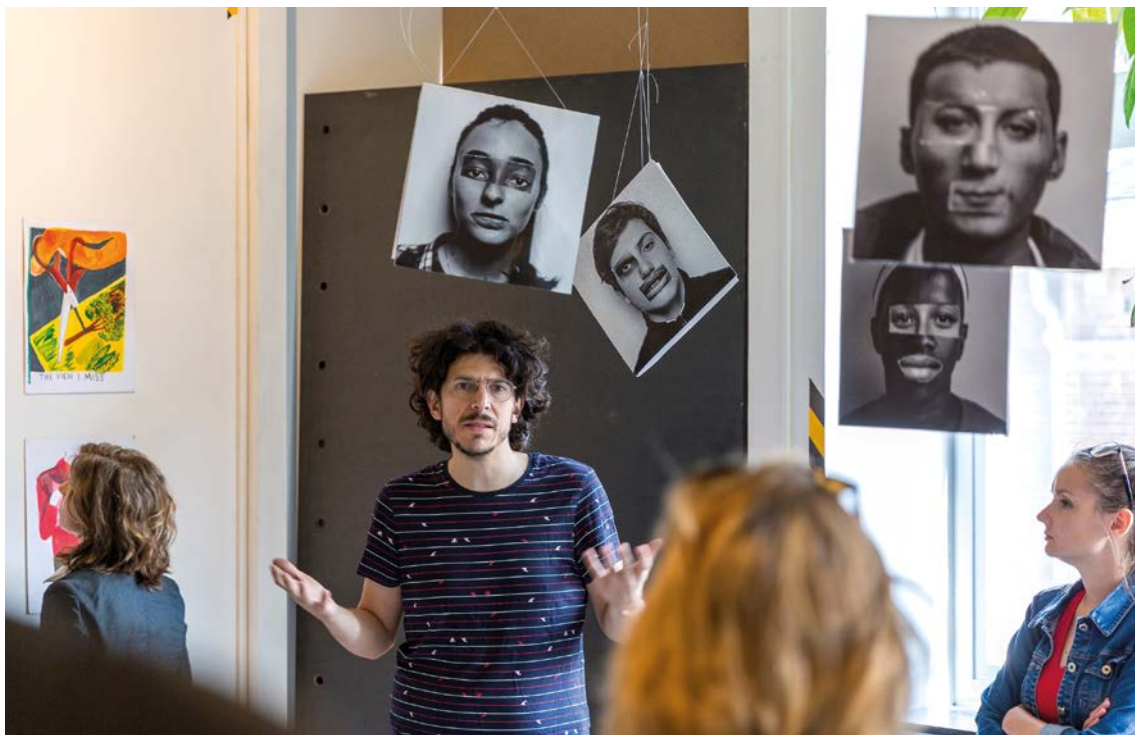
Participants of the City Lab looking ahead and reflecting upon the future, during a field visit

Cities cannot respond to the challenge alone. Effective multi-level governance models and collaborative delivery models are needed to scale up action. Citizens and social movements also need to be involved in participatory decision-making 19 . And open data and digital tools 20 can be used to encourage transparency, and support new methods of action.