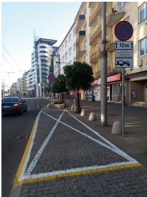
Improving delivery traffic measures in downtown Gdynia

Through participating in URBACT Freight TAILS network, Gdynia put in place an evidence-based and participatory process to develop an urban freight plan to enforce a comprehensive, structured and systematic approach to city logistics.