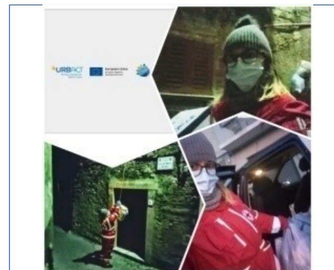
Cooperation of the Municipality with the Italian Red Cross and the Civil Protection during the first Covid-19 wave through the activism of our ULG members