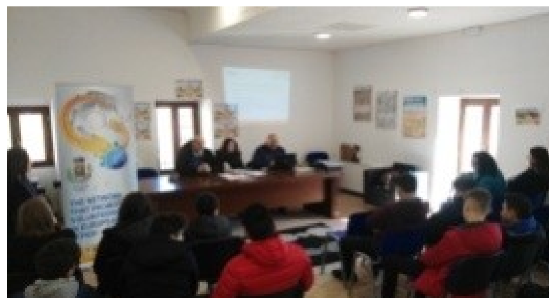
ULG meetings (Capizzi) and TNMs (Pregrada and Altona) where an effort of strict cooperation has been made to create new start-ups conceived as social enterprises giving work to weak categories and unemployed women and young people