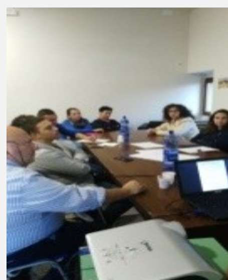
ULG members sharing contents of Statute and Internal regulation of the new MCV for Capizzi