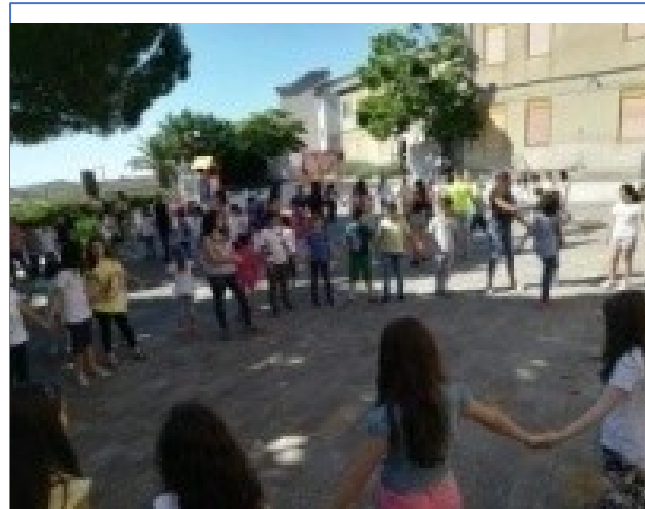
Elementary school children and secondary school teenagers who meet during the GRESt event