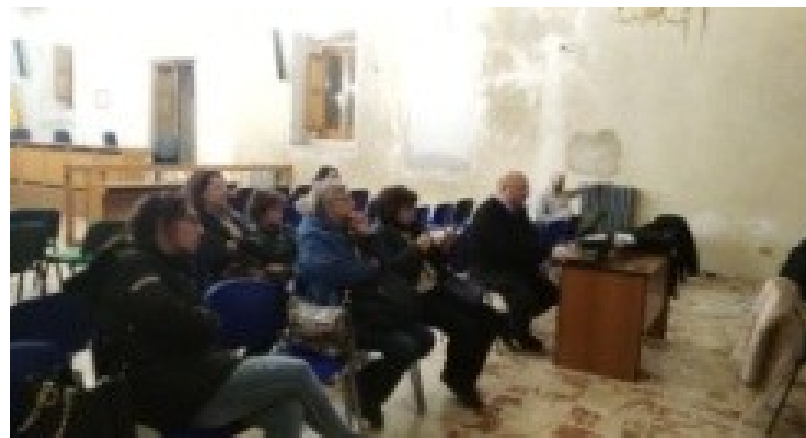
Governance process being developed through ULG meetings