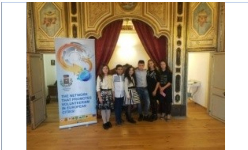
FAI days managed by children, who guide and show visitors the most important cultural goods and museums in the city