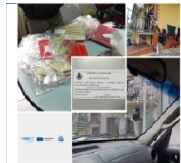
Food and medicines being delivered at home to elderly and/or needy people by our ULG activists