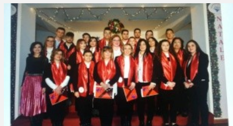
The City Polyphonic Choir created thanks ULG meetings