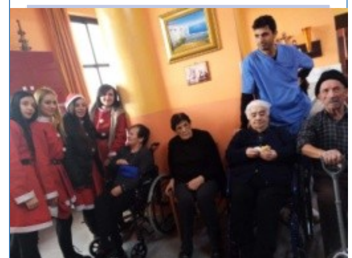
Visits of youngsters to the elderly during Christmas period