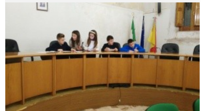
Representatives of the Mini-City Council working in the ULG