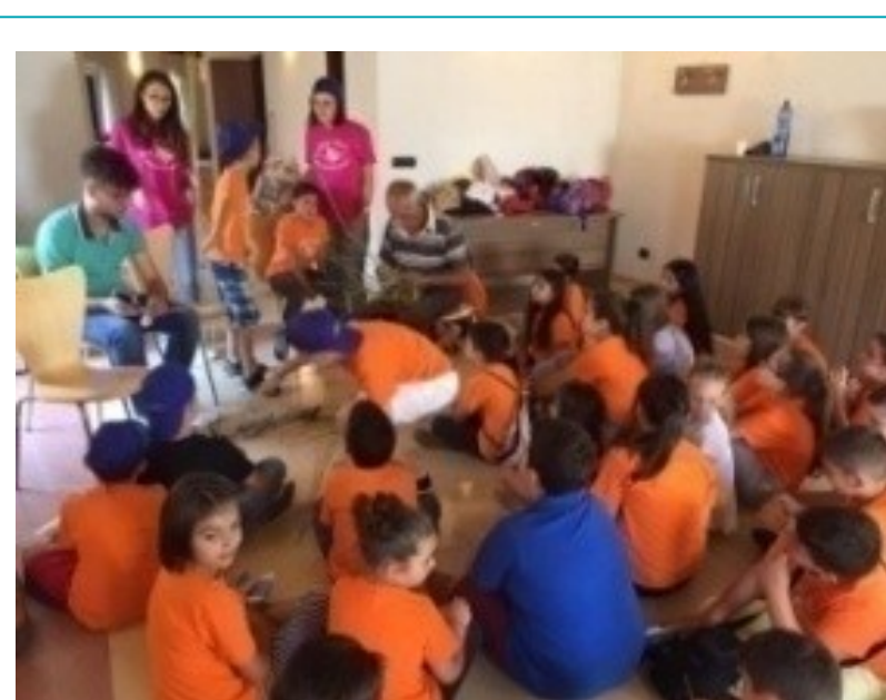
Know-how transfer for the creation of the "Cannistri", wicker baskets of ancient tradition, from elderly to young people and from youngsters to children

- ULG FEB 2020: "After a short break for lunch, the work of the ULG begins again with the fourth point in the Agenda, that is, the progress for the establishment of the wool enterprise. People have been identified who will be part of this company and who have knowledge of the primary material that we are going to work with and experience in its processing; in addition, the companies that will supply us with wool are being identified and the Municipality is well available, since now, to make available a property in the historic centre, with a view to circular sustainable reuse, aimed at creating jobs and the social inclusion of