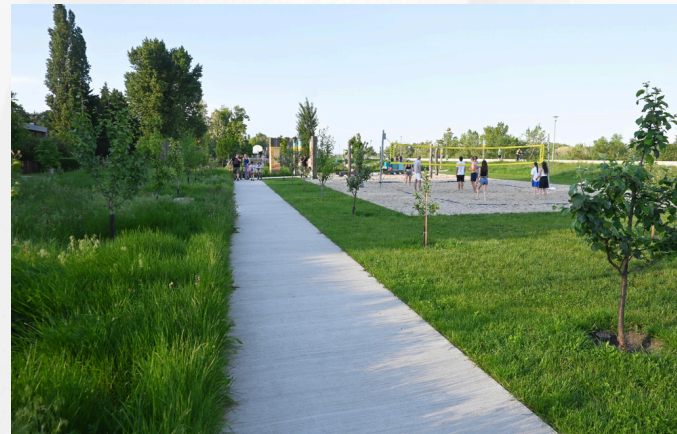
Orchard next to the recreational area in the award-winner Pünkösdfürdő Park, Budapest

Having fruit trees on the streets is often a sensitive question: people tend to complain about falling fruits, the related smell and insects attracted by them (which did not disturb inhabitants too much some decades ago). Having them in public green spaces is another story since they can significantly increase the biodiversity of a given location and the fruits do not make “trouble”. For example, Budapest created its first experimental orchard in the award-winning Pünkösdfürdő Park, planting a total of 75 trees from 24 different species. An underground irrigation system from two sides nourishes the tree roots, supplemented by manual watering when necessary. Edible forests have a long literature, and community harvesting in a park is great fun!