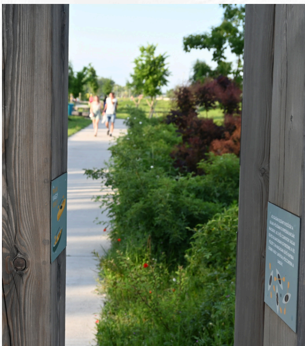
Pünkösdfürdő Park, Budapest