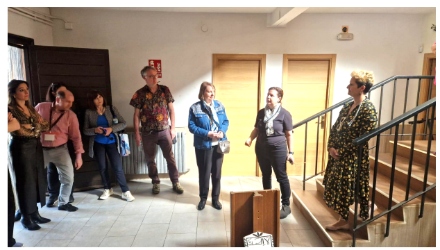
"Intermediarios": the link between housing and exploitation on the labour market

An additional complication is the mobility of the workers who chose Albacete province as their base, but who follow the harvests, and who work mostly outside the city boundaries. El Pasico, a housing facility for migrants run by ACAIM and Médicos Mundi Sur outside the city boundaries provides young newcomers, many of them without papers, with housing and basic support (e.g. professional orientation and language training). This is particularly relevant as formal work relations and training are a ground for regularisation in Spain based on a called "arraigo" procedure (literally: "rootedness"). The proximity to villages provides formal and informal work opportunities for the residents - they become a familiar part of the local environment. Residents participate in the maintenance of the building.