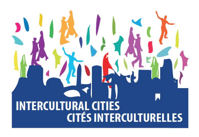
Liège - Co-designing the "carte ardente" - a new tool to reaffirm the inclusive and hospitable identity of the people of Liège

The département Seine-Saint-Denis has joined the Council of Europe's Intercultural Cities initiative that supports cities and regions on their way to developing intercultural strategies through benchmarking and exchange. This new engagement is a sign of the départments philosophy of embracing diversity and unconditional welcome.