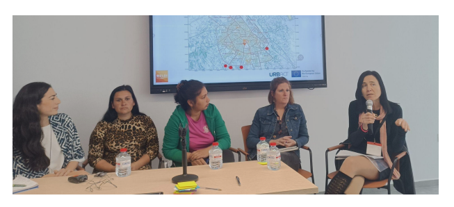
Ending homelessness through housing-led support - insights from the URBACT network ROOF

Seine-Saint-Denis also has a number of informal settlements on its territory. The outreach work of Médecins du Monde in multidisciplinary teams was first focused on access to health care (in particular for pregnant women). Now that relationships have been developed, they extend work to other areas and bring in other associations, e.g. on housing, jobs, schools.