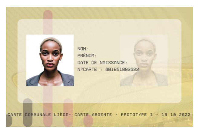
Prototype of the Carte Ardente created for the civil society coalition "Liège Ville Hospitalière"

and hospitable identity, while facilitating access to public services for newcomers. The card will also enable undocumented migrants to prove their residence in the City of Liège, thereby facilitating access to healthcare and cultural activities, and making it easier to lodge complaints with the police, etc.