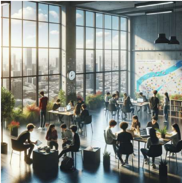
Community events @ Urban Sport Hub

Re-Gen Hackathon, challenging youngsters to find sport solutions for public space regeneration