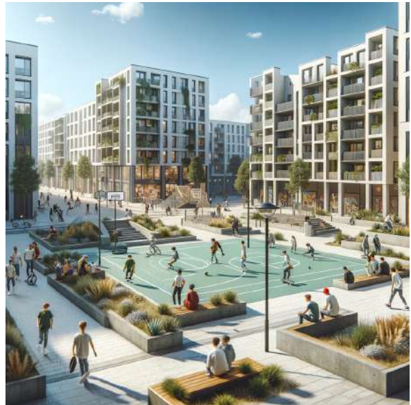
Street Sports Bootcamps and Events