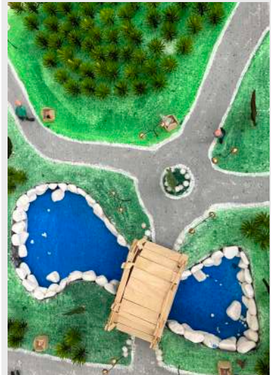
Teens design inputs.

In Dobrich, collaborative spirit takes the lead as volunteer architects from the URBACT Local Group (ULG) team up with the youth to co-design the park community space. Nestled among schools, church, and a bustling neighborhood, the abandoned area is buzzing with youthful ideas for sustainable regeneration, showcasing how shared efforts can breathe new life into urban landscapes.