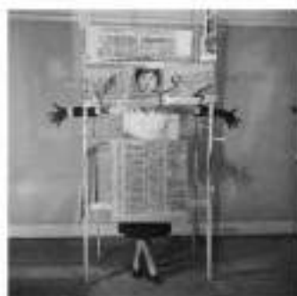
Designing an archive digitisation project

Making a case for support and assembling a project team