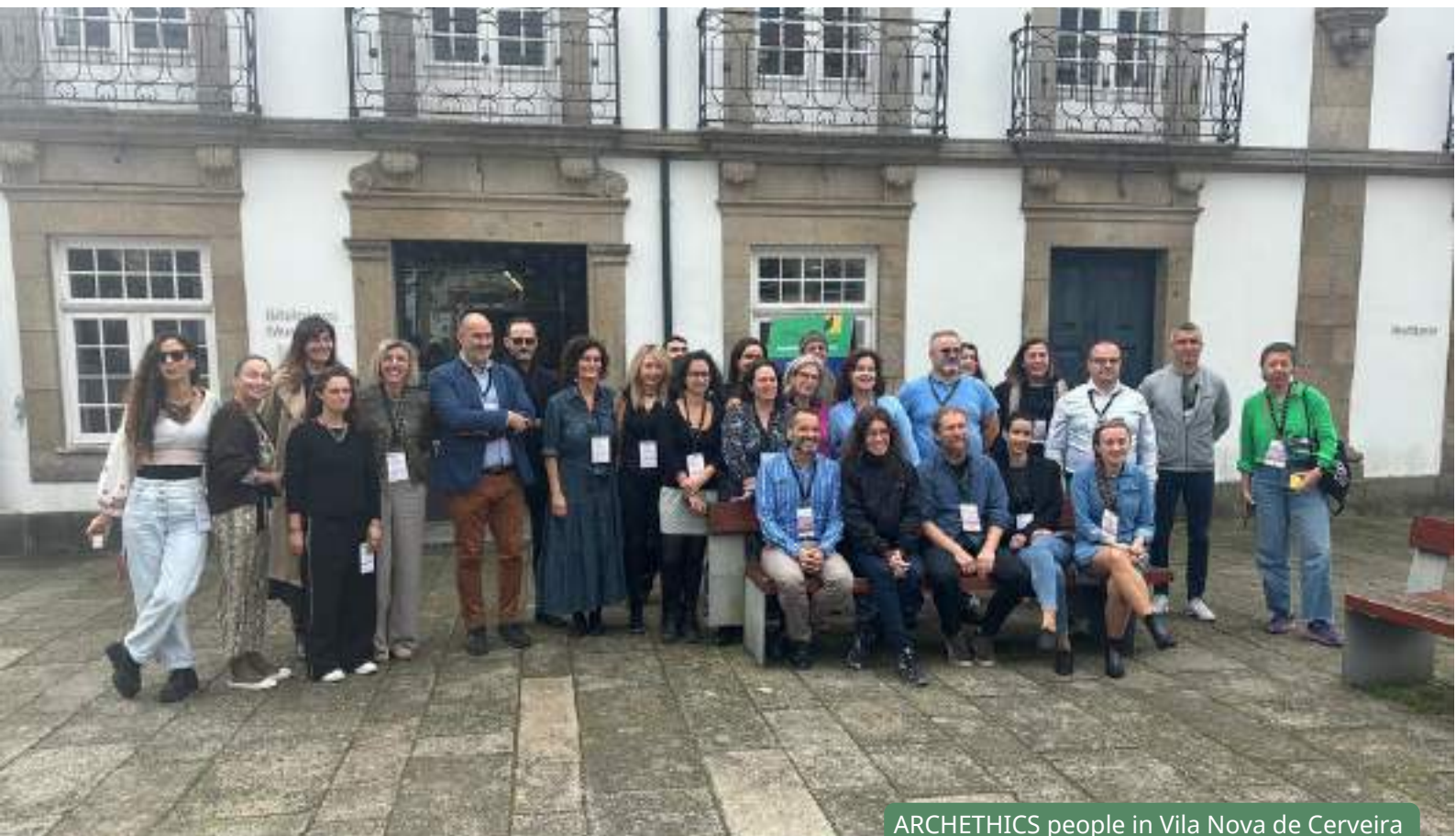
ARCHETHICS people in Vila Nova de Cerveira