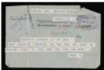
Funding and managing an archive digitisation project

Following, partners were involved in a group exercise focused on digital initiatives to be promoted in their Integrated Action Plans.