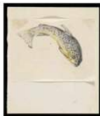
Publishing archive collections online

From planning to delivery and all that's in between