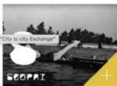
Darsena ieri, oggi e domani