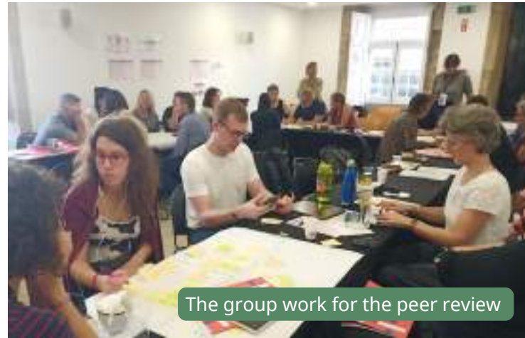
The group work for the peer review

Exercise 2: A brief overview of the Cerveira’s IAP was provided. Participants were asked to select and develop two actions (either from the matrix or newly proposed ideas), discussed them in the group, and engage in a final discussion.