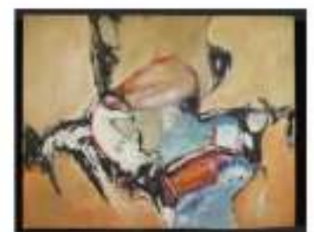
Supporting learning and participation with archives

Supporting the discovery of digitised archive collections through online engagement