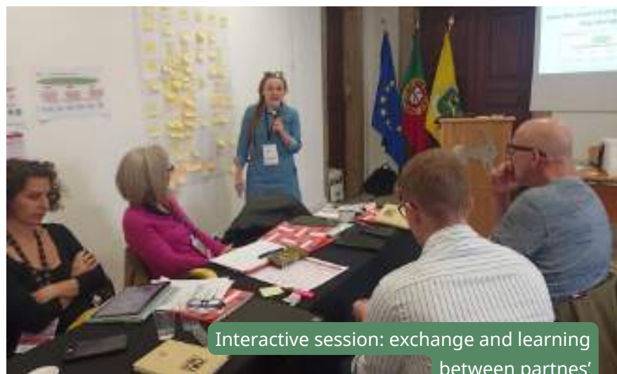
Interactive session: exchange and learning between partners

This positive and trusty experience has been helping the smooth exchange and learning and make the participation at network activities pleasant and productive.