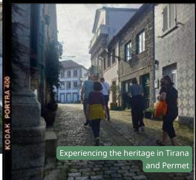
Experiencing the heritage in Tirana and Permet