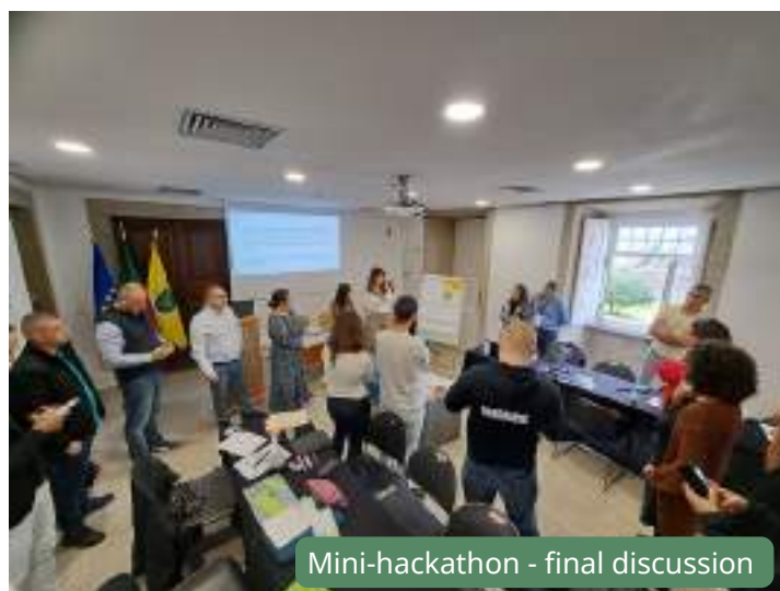
Mini-hackathon - final discussion