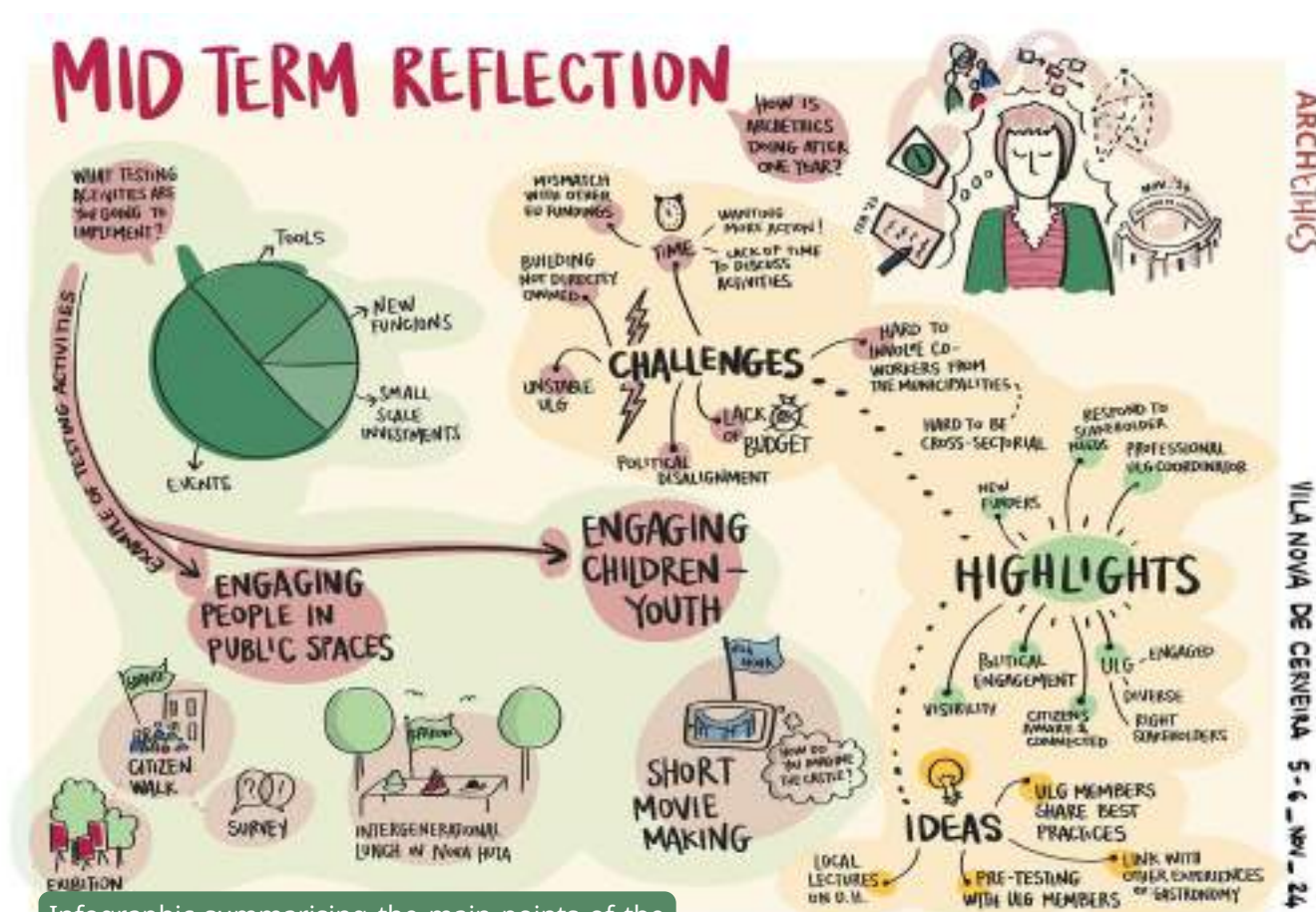
Infographic summarising the main points of the Mid Term Reflection, designed by Sara Galeotti - La casa del Cuculo