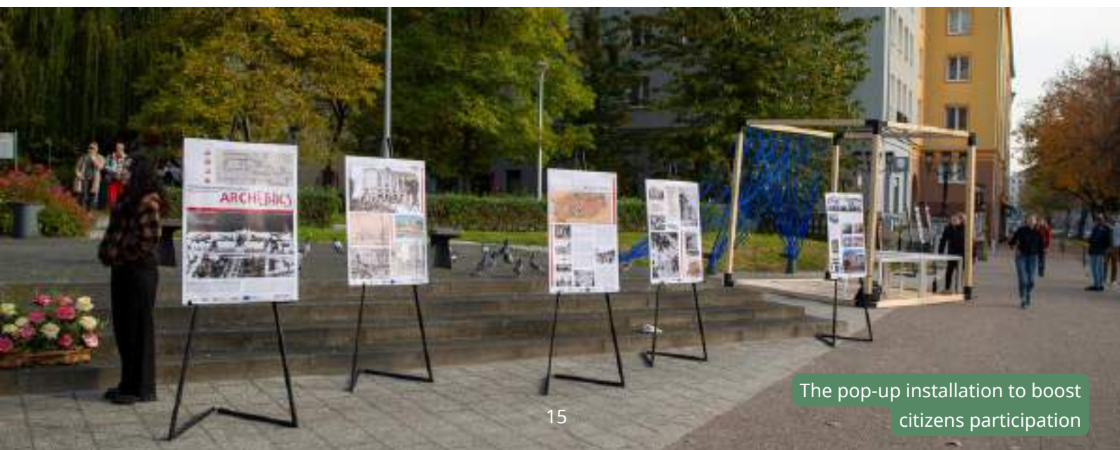
The pop-up installation to boost citizens participation

The city of Gdansk through ARCHETHICS is willing to tackle the challenges dealing with: the degradation of the urban public space, the problem of traffic and noise, the short-term rentals, the lack of green space, the spatial barriers for pedestrians, the district depopulation, the protection of the architectural features.