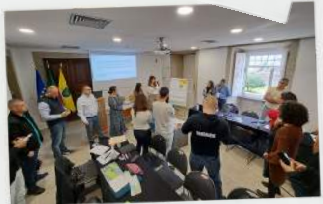
First Bilateral exchange focused on Digital Transformation and green transition