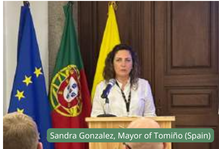
Sandra Gonzalez, Mayor of Tomiño (Spain)