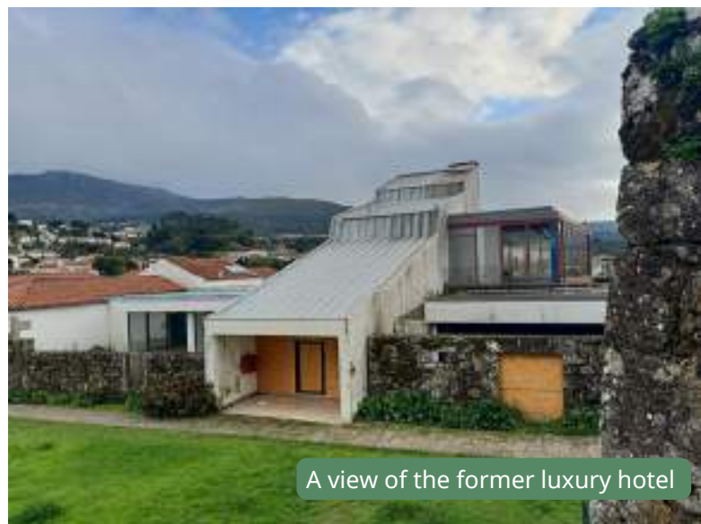
A view of the former luxury hotel