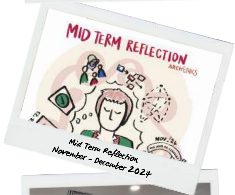
Mid Term Reflection November - December 2024