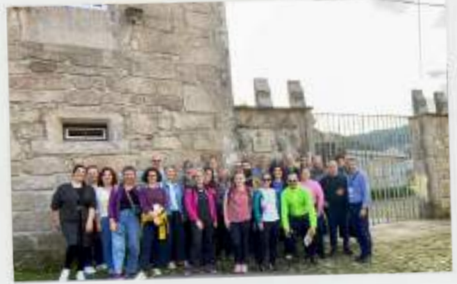
Core Network Meeting in Vila Nova de Cerveira 5-6 November 2024