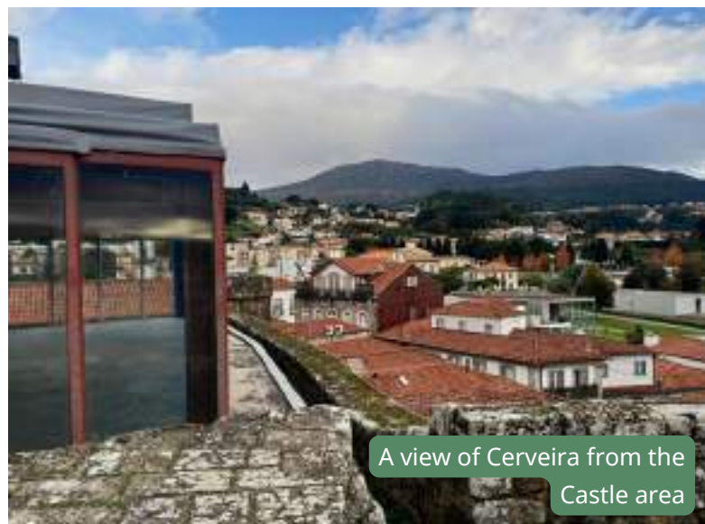
A view of Cerveira from the Castle area