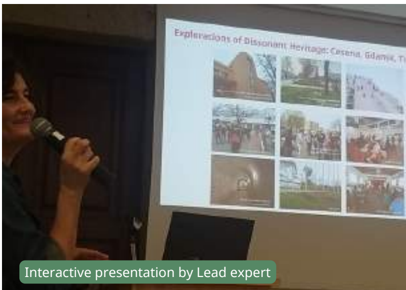
Interactive presentation by Lead expert

The URBACT Secretariat shared the objectives and the importance of the Mid Term Reflection. The Lead Expert presented the "State of Art" , sharing project activities and progress as well as the results of the online survey, administered to project partners before the meeting. The survey invited partners to revisit their Action Planning experience and evaluate the progress to date against their initial expectations. An interactive session based on the survey answers was provided to explore partner views and help network activities going forward.