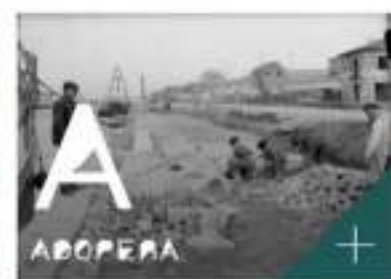
Cassetta degli attrezzi