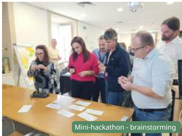
Mini-hackathon - brainstorming

Hackathon Challenge: How might we embrace / use digital technology to reimagine and repurpose this abandoned totalitarian heritage site, transforming it into an interactive space where all can connect, learn, and contribute to community-building and cultural understanding?