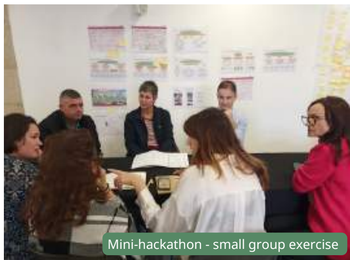
Mini-hackathon - small group exercise