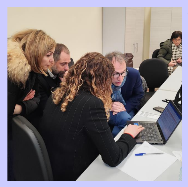
(template suggested by the Project Lead Expert).

Tools used during the meeting: Action detail tables.